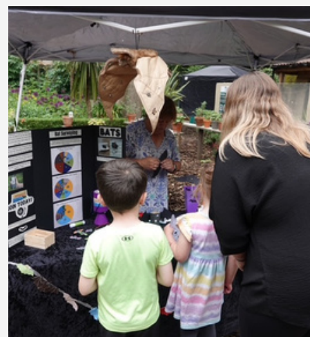
IMAGES OF 2025 EVENTS ATTENDED BY CLEVELAND BAT GROUP.

Other events included a bat walk and talk at Great Ayton in September. Within 30 minutes of detecting around the waterfall park, the group identified daubenton's bats, common pipistrelles and soprano pipistrelles. A talk followed the bat walk in Great Ayton Library.