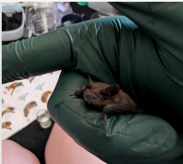
COMMON PIPISTRELLE.