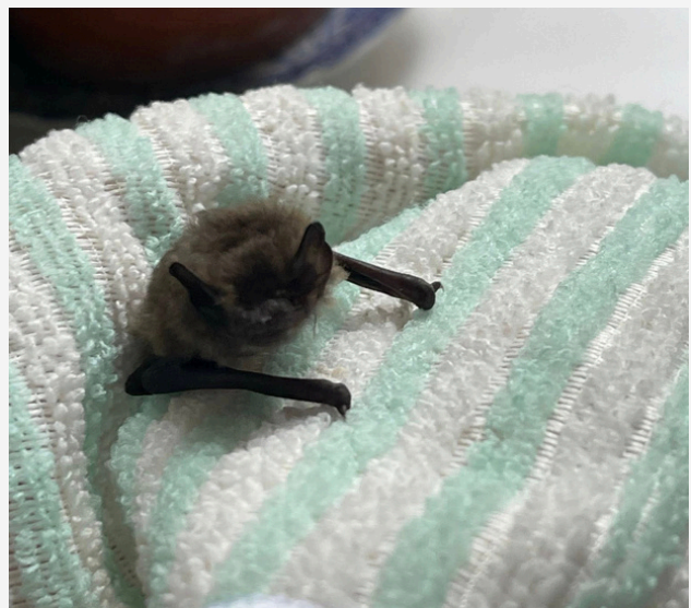
IMAGE OF JUVENILE C.PIPISTRELLE