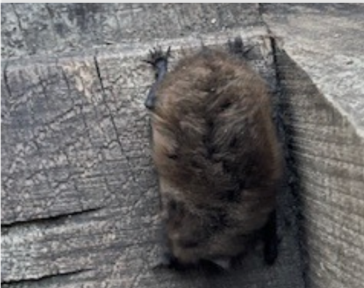
COMMON PIPISTRELLE.

Bats may begin to leave their roosts occasionally for a drink of water or to seek food, on warmer February nights.