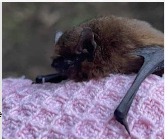
COMMON PIPISTRELLE.

Throughout the 2025 season, 19 bats were taken into care; 8 were released; 1 remains in care and is continuing to recover. The bats who did not survive either died in care or were supported to pass peacefully with vet assistance.