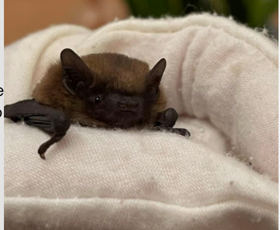
COMMON PIPISTRELLE.